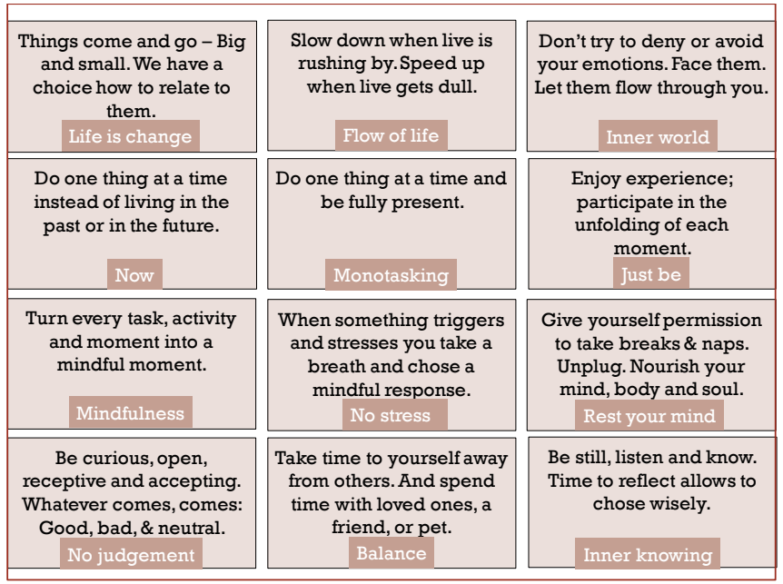
Fig. 2. What matters is how we relate moment-to-moment with present awareness to life, work, study, people, and the world.

The practices of mindfulness cultivate the ability to become more aware of thoughts, emotions, and actions, and thus, give us the tools to choose wisely and live up to our highest potential. Mindfulness practices, such as meditation, breathing and concentration practices, body scans, yoga, mindful eating or walking, train us to be aware of moment-to-moment experiences in life, at work/study, and in relationship to people and the world (Fig. 2).